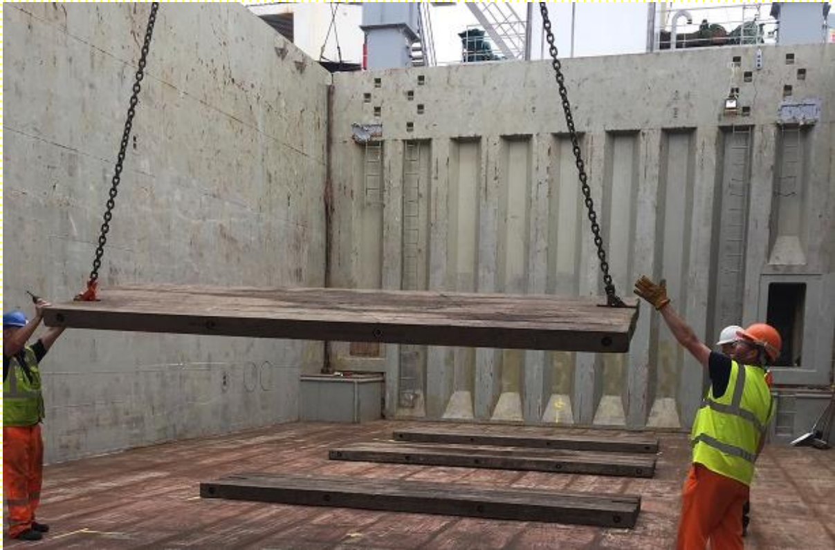
Hold Photos (Looking Aft, Bulkhead stowed)