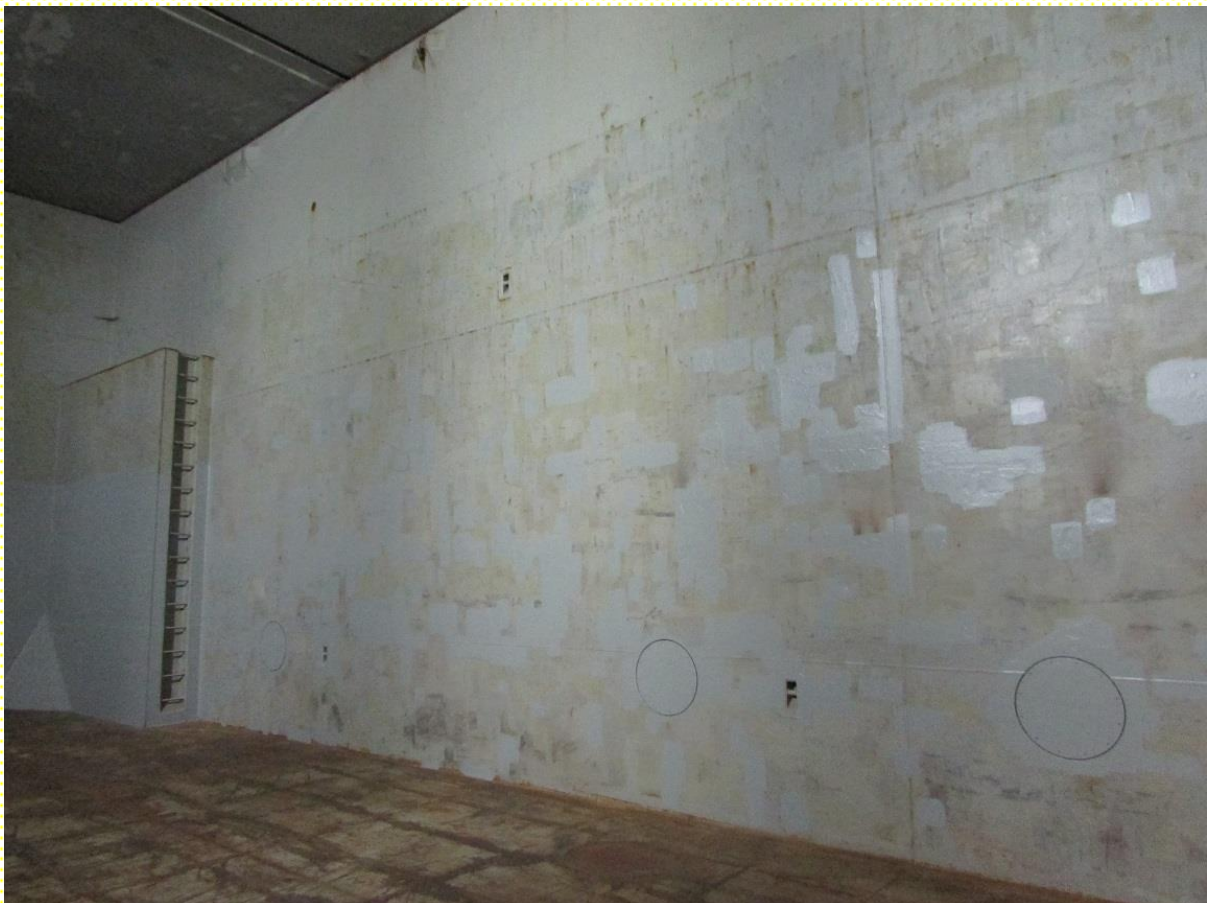
Hold Photos (Looking Forward)