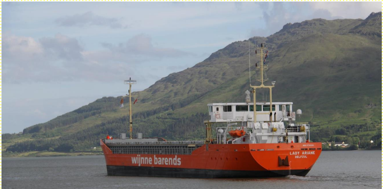
MV Lady Ariane