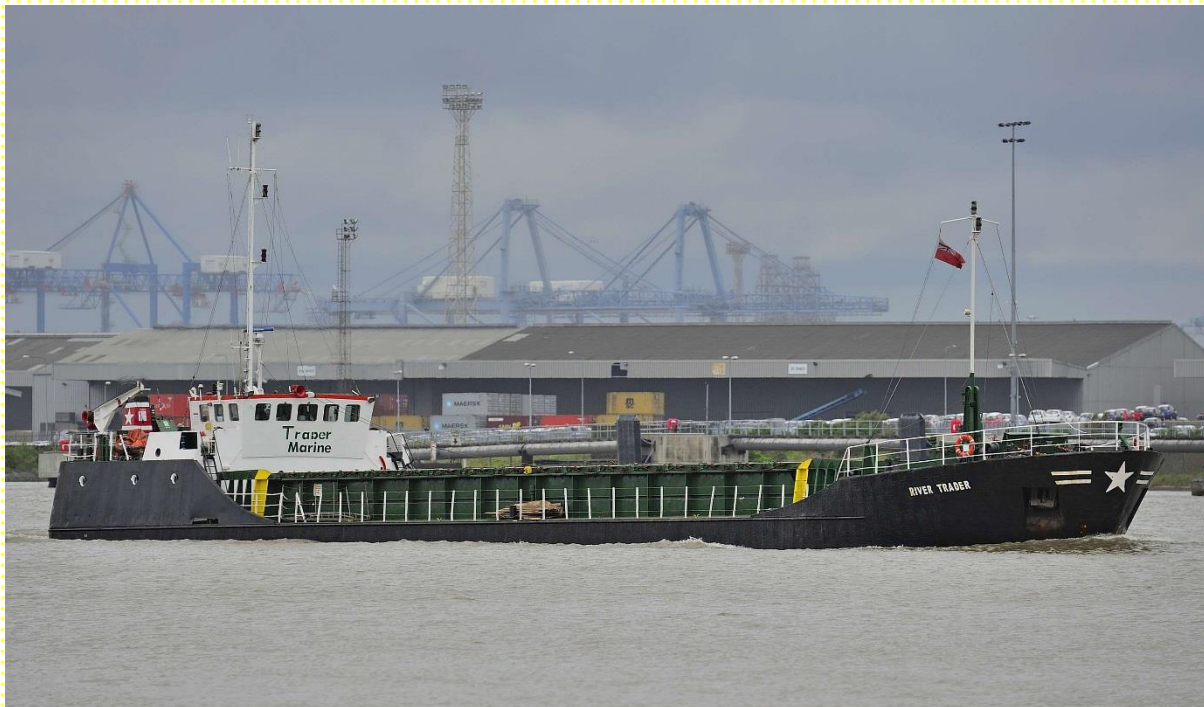
MV River Trader – Sister vessel of mv River Pride and mv River King