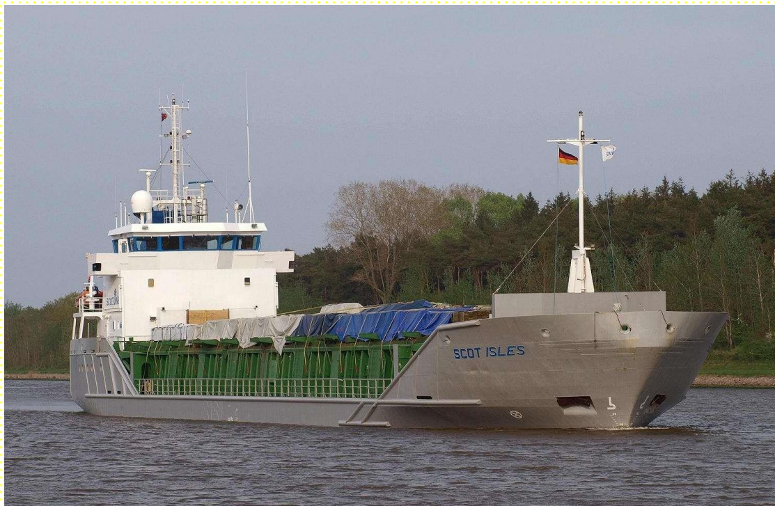
MV Scot Isles