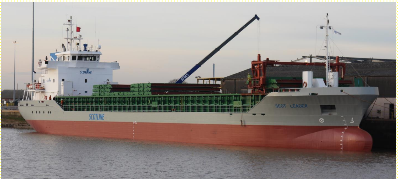
MV Scot Leader