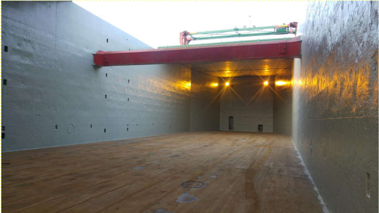
Hold (Forward) – Note Strong Beam Position