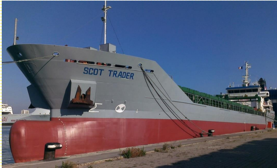
MV Scot Trader