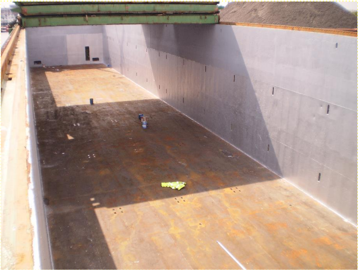
Hold Photo (Fore)