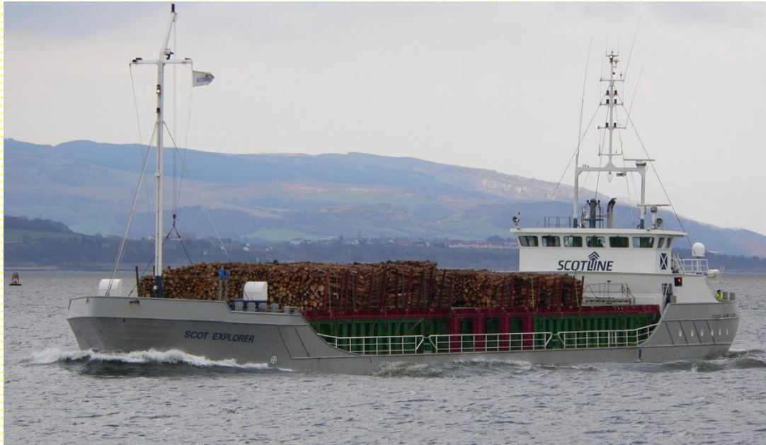
MV SMN Explorer on Time Charter to Scotline