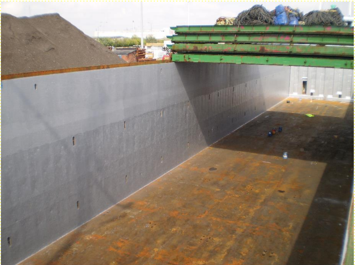
Hold Photo (Aft)

(All details believed to be accurate but subject to verification)