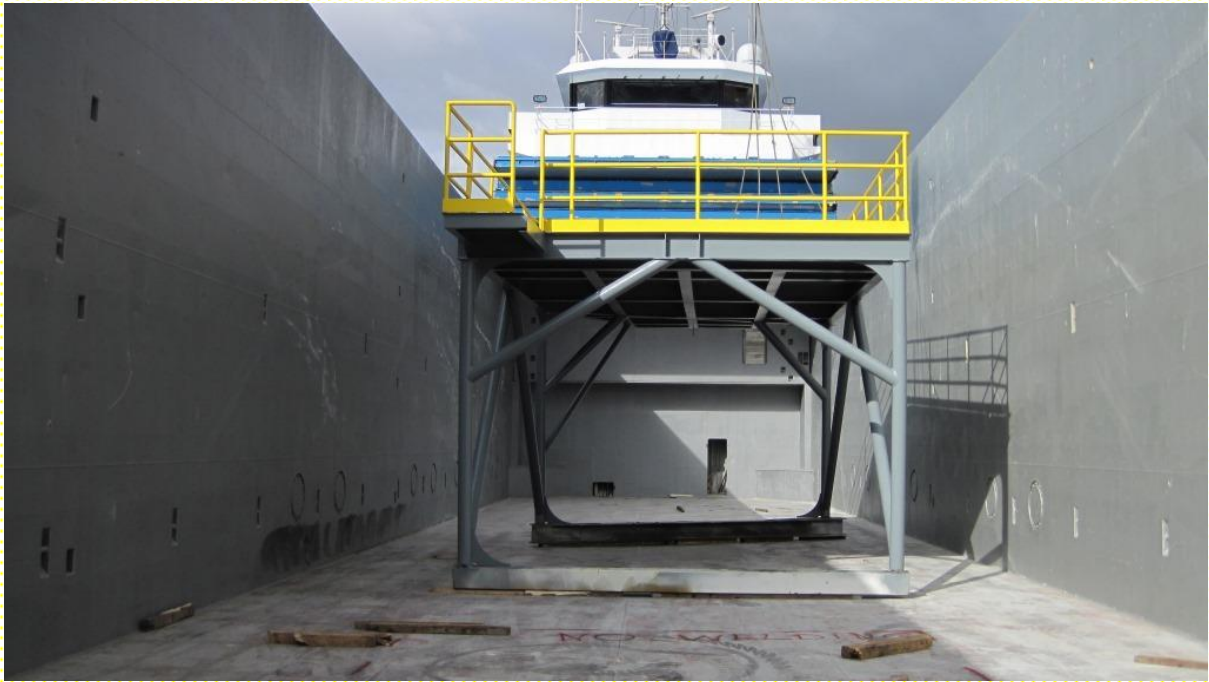
Hold Photos (Looking Aft, Bulkhead stowed)