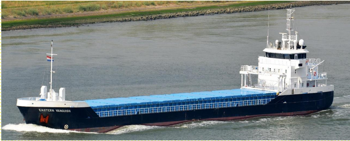
MV Eastern Vanquish