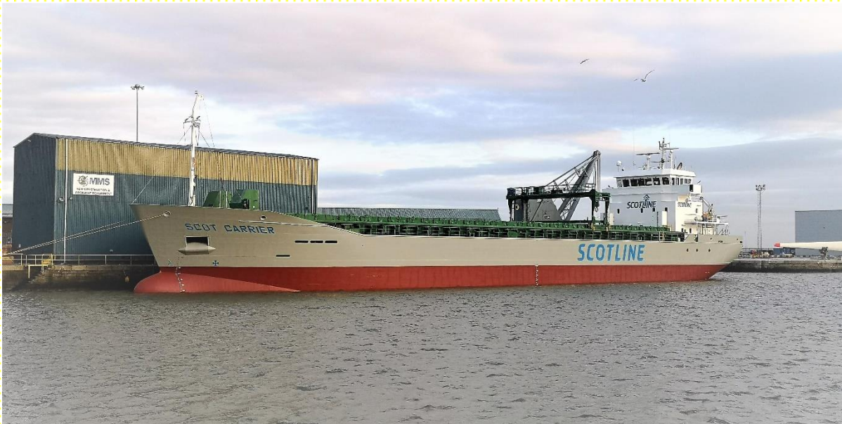
The New MV Scot Carrier – Built 2018