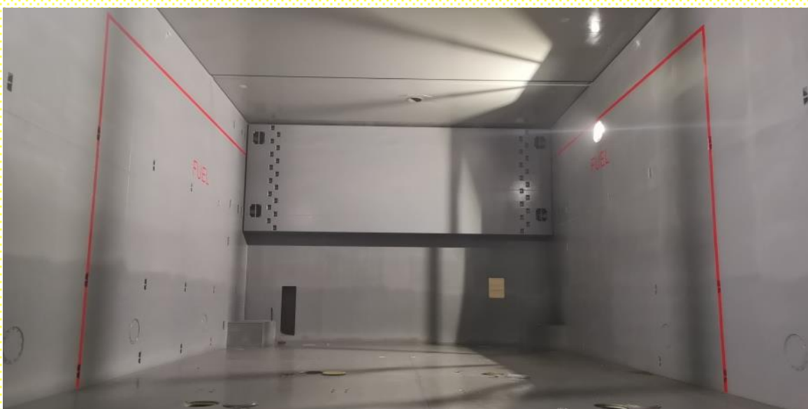
Hold (Aft) – Note that Bulkheads are normally stowed aft. Note also no welding where fuel tanks are marked. (All details believed to be accurate but subject to verification)