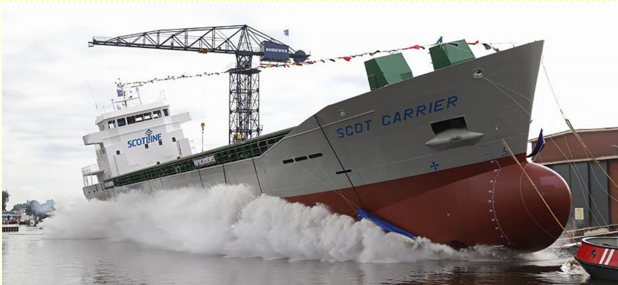
The New MV Scot Carrier – Built 2018