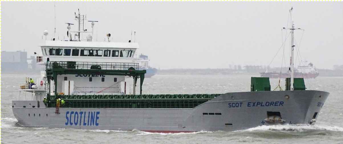
The New MV Scot Explorer – Built 2019