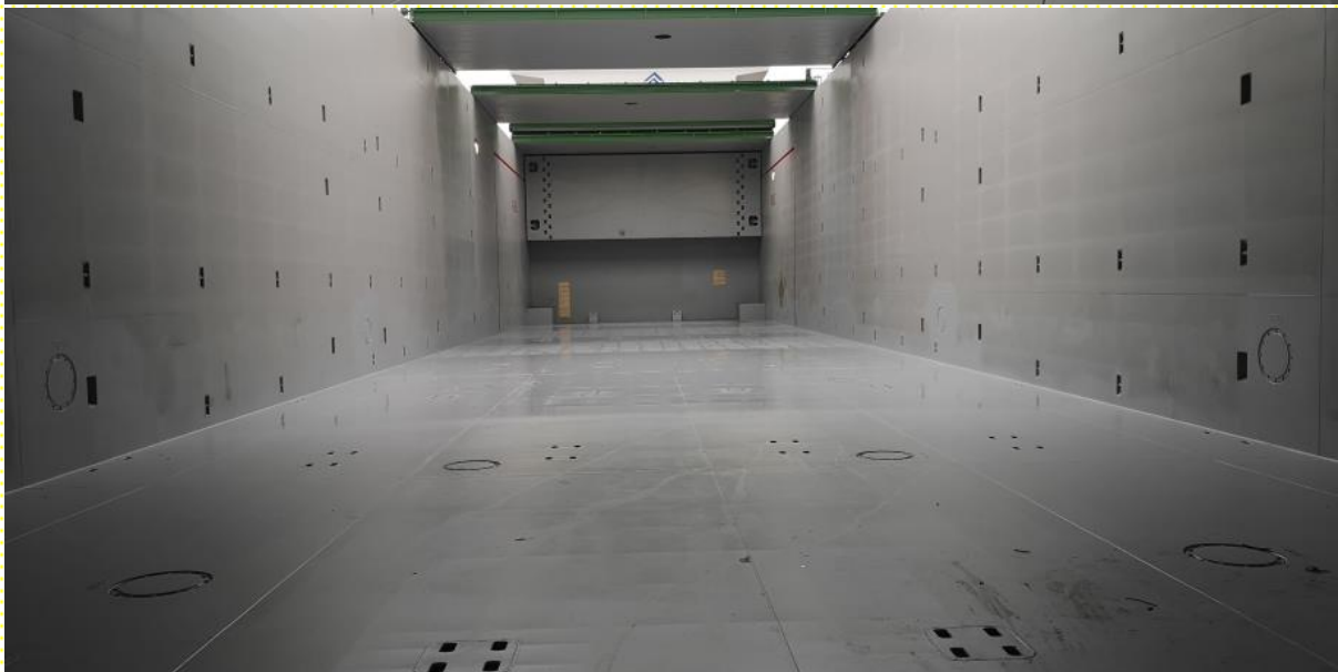
Hold (Aft) – Note that Bulkheads are normally stowed aft. No welding where fuel tanks are marked. Common arrangement as Scot Carrier.

(All details believed to be accurate but subject to verification)