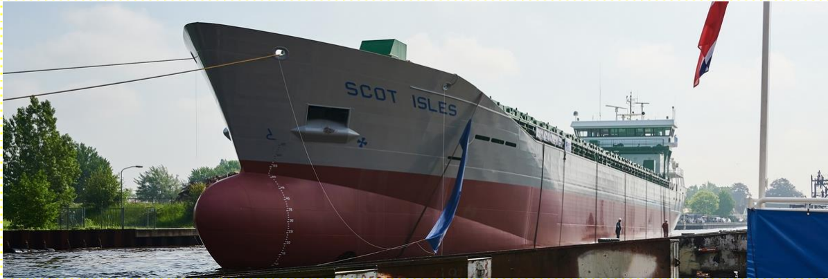
The New MV Scot Isles, built in 2021 at Royal Bodewes Shipyard