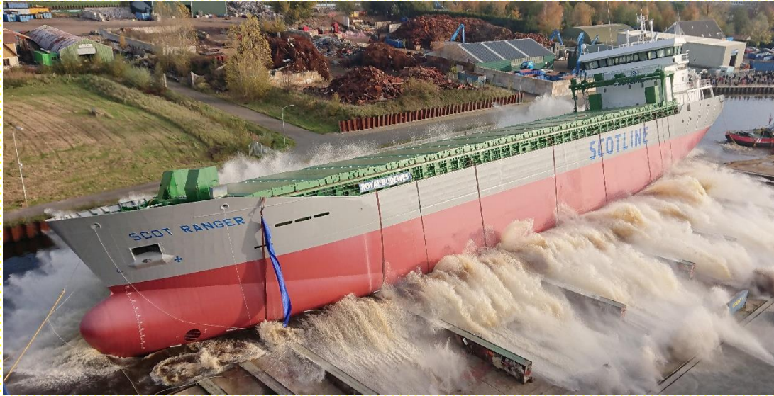
The New MV Scot Ranger, built in 2021 at Royal Bodewes Shipyard