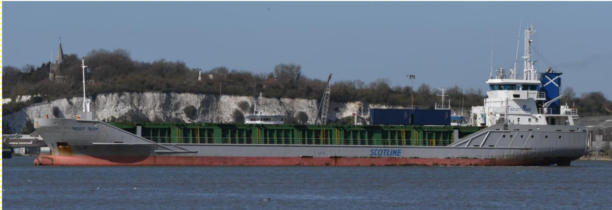
MV Scot Bay (ex MV Scot Isles - renamed 29/03/2021)