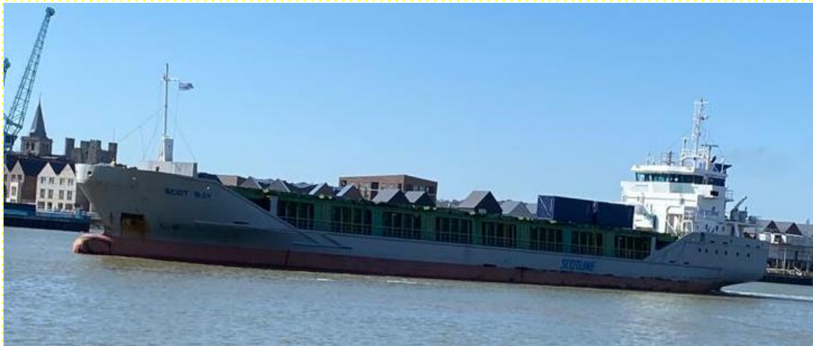
MV Scot Bay (ex MV Scot Isles - renamed 29/03/2021)