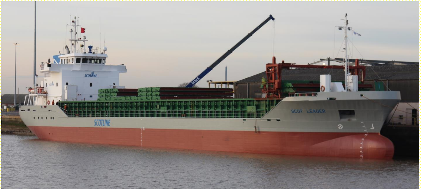
MV Scot Leader