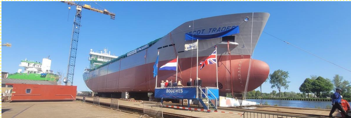
The New MV Scot Trader, built in 2023 at Royal Bodewes Shipyard