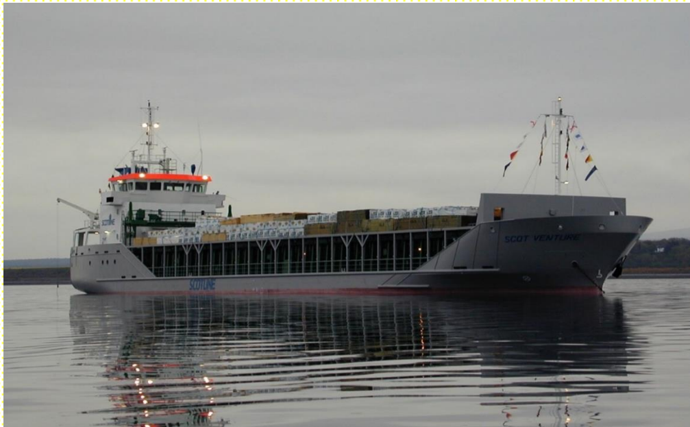
MV Scot Venture – Sister vessel to the Scot Mariner