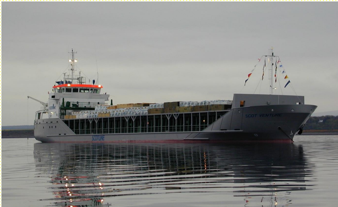
MV Scot Venture – Sister vessel to the Scot Mariner